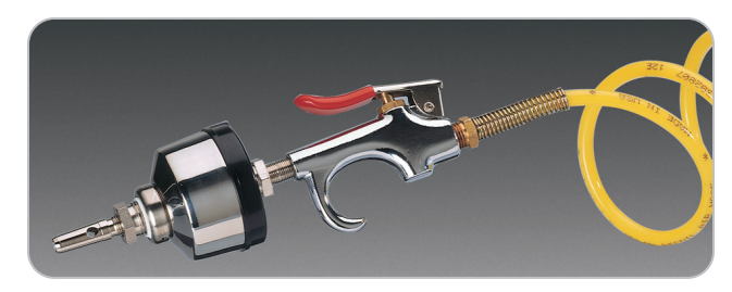
Optional Gun/Hose Kit (P/N 91-6150).