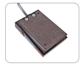
Optional hands-free Foot Pedal