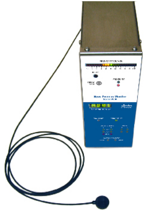
Figure 2. The Novx RVS sensor connected to the Novx Series 7000 Process Monitor.

The self-capacitance of a dime-sized electrode is of order 0.05 pF, while the input capacitance of present electrometer-grade amplifiers is of order 0.2 pF to 3 pF. By calibrating C_s/(C_{in} + C_s) – defined as the transfer function, the circuit yields a near ideal measurement of the electric potential at the sensor location. This potential at the position of the sensor allows strong correlation to electrostatic surface voltages (or voltage mirrors of insulator charge levels). The circuit has a flat frequency response from 100 mHz to 50 kHz. During the semiconductor wafer process, the movement of a charged wafer induces a change of the electric potential at the sensor location. Such a response on the sensor is proportional to the voltage on the wafer.