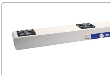
Aerostat Guardian Overhead Ionizer