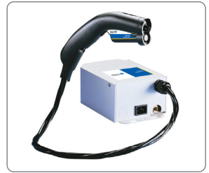
Top Gun Ionizing Air Gun