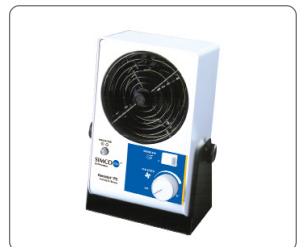
Aerostat PC Ionizing Air Blower