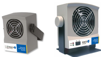
Model 6422e-AC (left) blower is ideal for in-tool confined spaces. Model 6432e (right) blower may be used inside tools or at a workstation.

The slightly larger Model 6432e has a tool mounting bracket or benchtop stand.