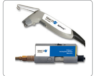
Model 6115 AirForce Blow-Off Gun