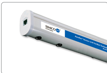
Model 5685 Ionizing AeroBar