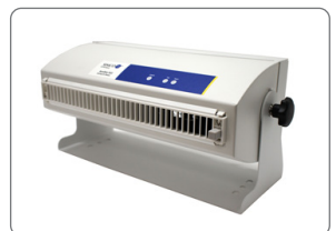
Aerostat XC2 Ionizing Air Blower