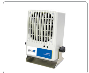
minION Ionizing Blower