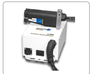
orlON Ionizing Air Nozzle