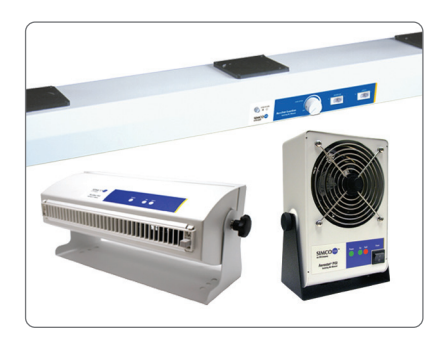
Ionizing Blowers for Device Protection in Test and Assembly