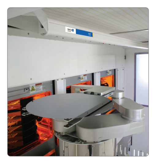
The industry-standard Digital AeroBar system provides balanced, optimized ionization inside tools and mini-environments.

The Model 5635M Metal-free AeroBar MP provides the same performance for wet-clean and CMP tools where the presence of metals may adversely affect processes and yields. In tight areas where space is limited, the tiny QuadBar™ lonizers Models 4630/4635 deliver ionization at close distances.