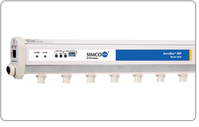
Ultra-clean AeroBar for ISO Class 1