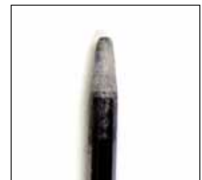
Discoloration and whitened tips on silicon (right) and titanium emitter points (left).