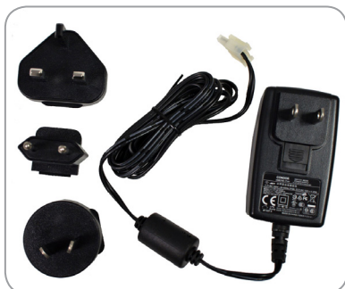
AC Adaptor Kit 14-21244 includes interchangeable US, UK, Continental Europe and China electrical connectors.

1. Tested in accordance with ANSI/ESD STM3.1-2006.