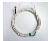
Micro ESD Antenna

The optional Charge Device Model Event Simulator (CDMES) was designed to allow ESD detectors to be calibrated inside the tools and processes where CDM events occur. This simulation tool allows calibrated CDM events of different magnitudes to be produced at the location where production devices are most vulnerable and where ESD monitoring sensors are located. Other options: