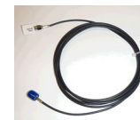
Micro Directional ESD Antenna