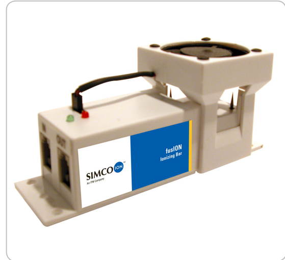
fusION with Fan Attachment

The performance of any ionizer, including fusION, can be improved with the addition of controlled airflow. In applications that may benefit from improved airflow, an optional fan assembly is simply clipped to the fusION housing and power to the fan is supplied through a built in connection.