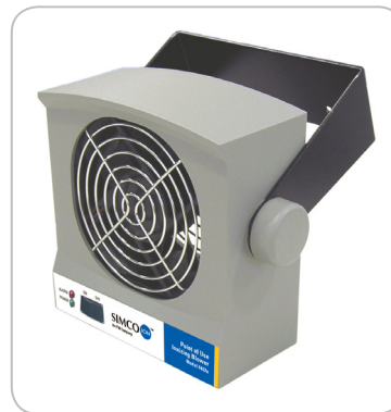
The Model 6432e is offered either with a smaller in-tool stand (shown here) or a larger benchtop stand, shown in the photo on the front of the datasheet.

For increased flexibility, the Model 6432e Blower can be directly powered by process equipment or 24 VDC/VAC power to fit the needs of your environment. For 100-120 VAC input power, use transformer #14-1420-01; for 230 VAC, use #14-1430-01; and for applications where DC input power is preferred, use #14-1322 or another 24 VDC source (performance will be reduced using DC power).