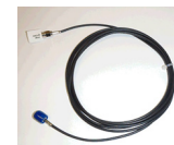
Micro Directional ESD Antenna