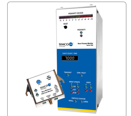
Embeddable Process and ESD Monitoring

Inside tools with high temperature environments such as diffusion furnaces, the High Temperature Ionizer Model 4610TF eliminates charges as they develop.