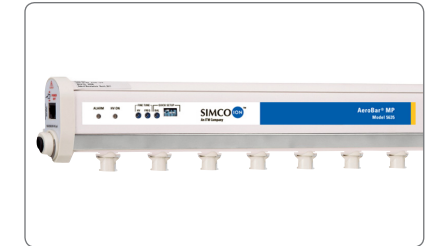
Ultra-clean AeroBar® for Extended ISO Class 1