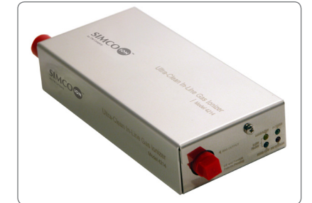
In-line Ultra-clean 99.999% Nitrogen Ionizer