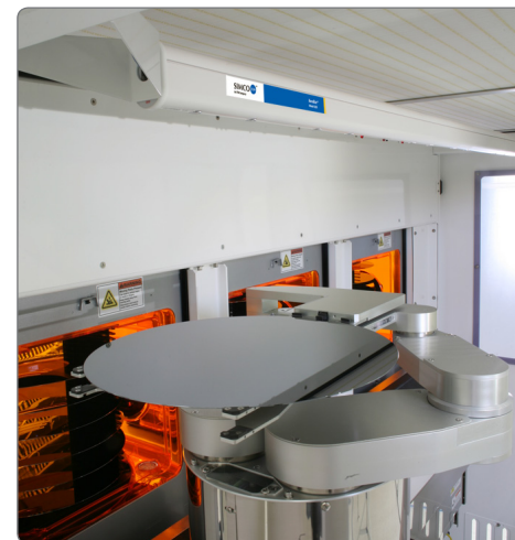
The industry-standard Digital AeroBar system provides balanced, optimized ionization inside tools and mini-environments.

Inside tool mini-environments and EFEMs, the Digital AeroBar® Ionization System Model 5225 uses IonMonitor software to adjust, control, and regulate ion output for continual optimized performance. The state-of-the-art Model 5635 AeroBar MP surpasses ISO Class 1 cleanliness, meeting "Extended ISO Class 1 for ≥10 nm particles", thereby providing the cleanest bar ionization available for leading edge wafer technologies. In tight areas where space is limited, the tiny QuadBar™ ionizers Models 4630/4635 deliver ionization at close distances.