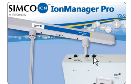
Room Ionization System