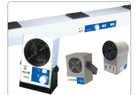
Ionizing Blowers for Device Protection in Test and Assembly