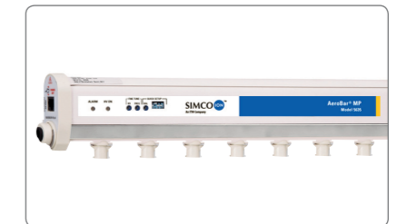
Ultra-clean AeroBar® for Extended ISO Class 1

In test, assembly and packaging areas, benchtop blowers Model AeroStat PC and wide coverage Model AeroStat XC2 provide protection at the workbench. Overhead Blowers Guardian and CR2000 models protect products from above the workbench or table, providing large area coverage. The lightweight, ergonomic Ionizing Guns Model 6115 AirForce Gun and the Top Gun provides handheld blow-off ionization. For voltage sensitive applications, Critical Environment Blower models provide ionization at 3V and down to 1V when used with a Novx monitor.