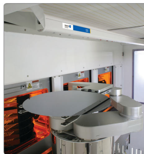
The industry-standard Digital AeroBar system provides balanced, optimized ionization inside tools and mini-environments.

The Model 5635M Metal-free AeroBar MP provides the same performance for wet-clean and CMP tools where the presence of metals may adversely affect processes and yields. In tight areas where space is limited, the tiny QuadBar™ Ionizers Models 4630/4635 deliver ionization at close distances.