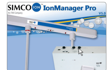
Room Ionization System