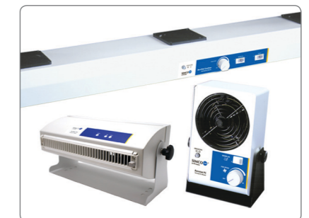
Ionizing Blowers for Device Protection in Test and Assembly