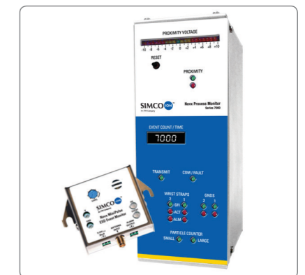
Embeddable Process and ESD Monitoring