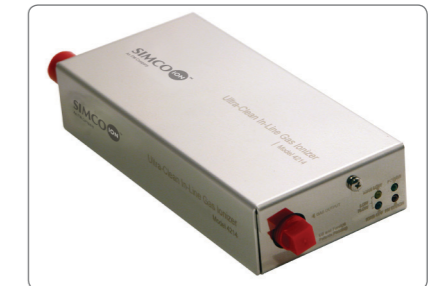
In-line Ultra-clean 99.999% Nitrogen Ionizer