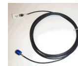
Micro Directional ESD Antenna