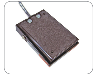
Optional hands-free Foot Pedal